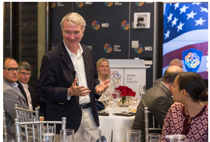
Gen. (ret.) Frank McKenzie, Jr. responds to audience questions at the CENTCOM Commanders Council Dinner, September 14, 2023.

E. development@mei.edu | T. 202-785-1141 x.205