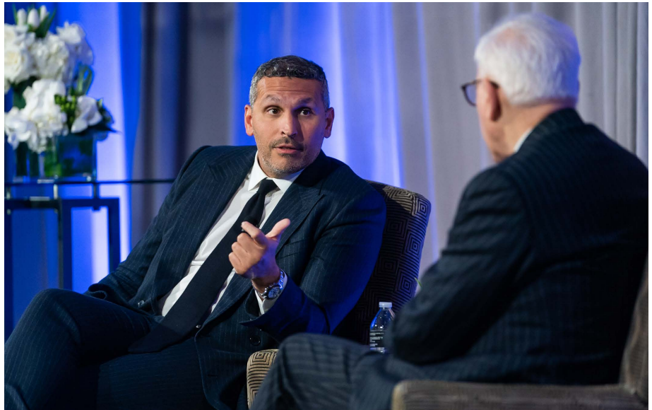
H.E. Khaldoon Khalifa Al Mubarak, Managing Director and Group Chief Executive Officer of Mubadala Investment Company, speaks to David Rubenstein, co-founder and co-chairman of the Carlyle Group, at MEI's Annual Gala, March 16, 2023.

M EI revitalized its corporate membership program in 2023 in order to cultivate a thriving community of private-sector partners who share a commitment to MEI's mission. Through our Corporate Council, MEI provides unique resources to senior executives and private-sector firms who find our geopolitical analysis directly relevant to their business and philanthropic interests.