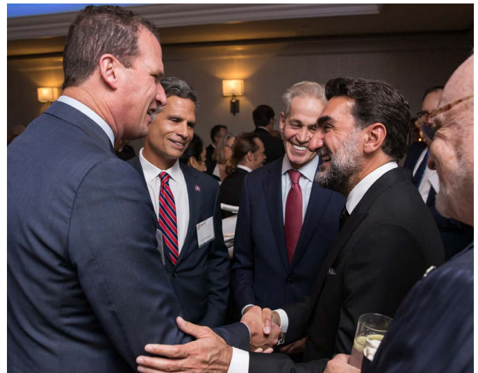
H.E. Yasir Othman Al-Rumayyan, Chairman of Saudi Aramco and Governor of the Kingdom's Public Investment Fund, receives guests at a VIP reception during MEI's 75th Annual Gala.