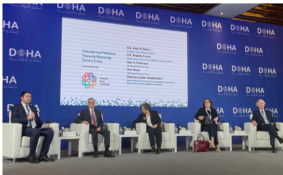
MEI Syria Program director Charles Lister moderates a panel on Syria policy at the Doha Forum, December 10, 2023.

MEI's Defense and Security Program provides rigorous, multidisciplinary analysis of current and emerging defense and security challenges facing the United States and its regional partners. The program serves as a unique, credible platform for defense and security stakeholders from the US and the Middle East to interact, exchange views, and share experiences on national security